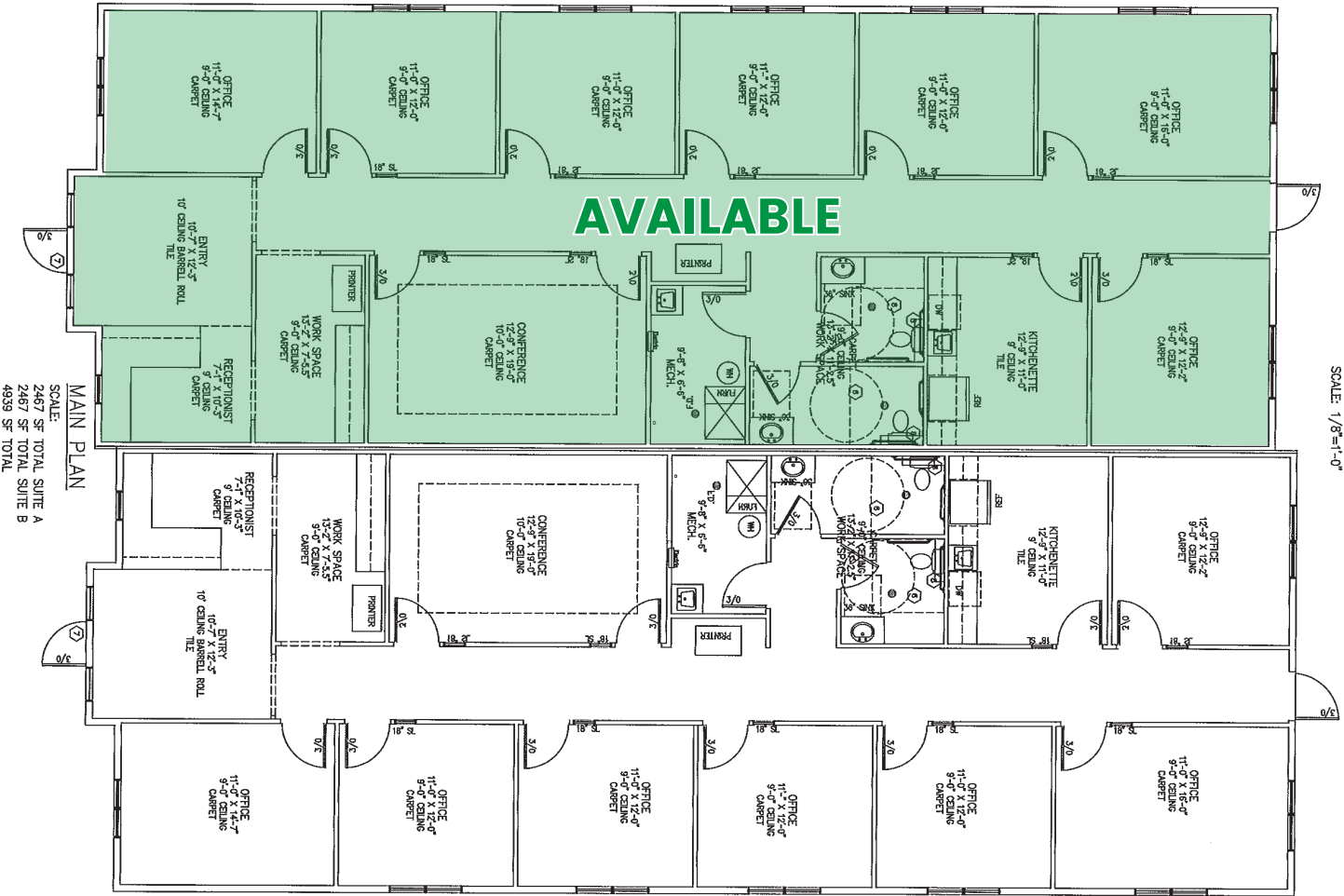
MAIN PLAN SCALE: 2467 SF TOTAL SUITE A 2467 SF TOTAL SUITE B 4939 SF TOTAL