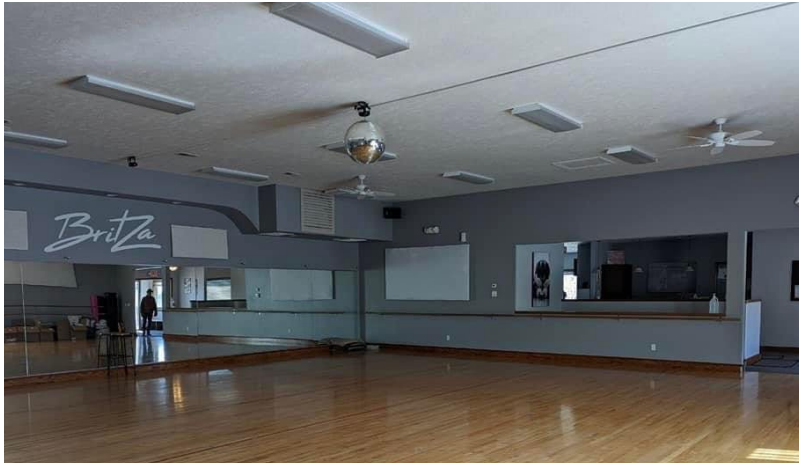
Main Level Dance Floor