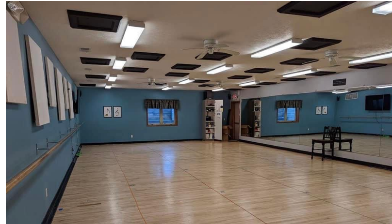
Lower Level Sprung Floor