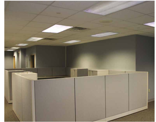
2,059 SF Office Space