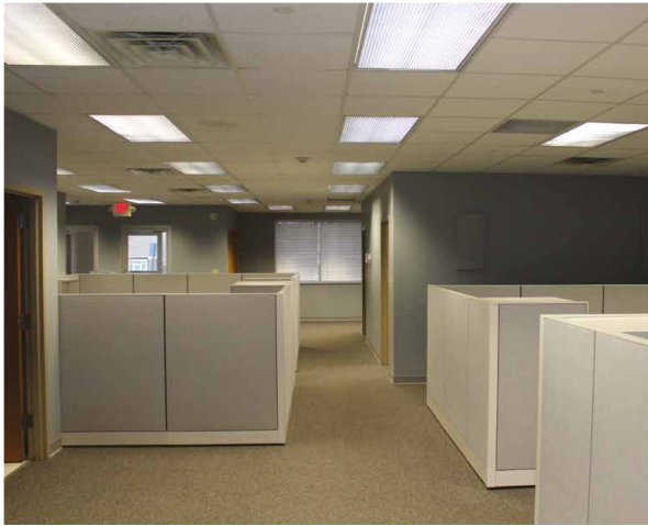
1,802 SF Office Space