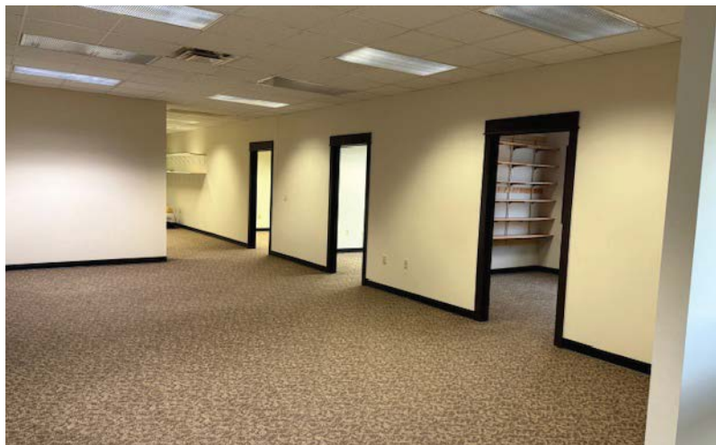
Open Area 2